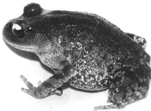
Fig. 1. Leptobrachium buchardi , new species. Life photograph of adult female MNHN 2003.1167.

(B) Head. (2) Head large, slightly longer (HL 21.7 mm) than wide (HW 20.6 mm; MN 18.5 mm; MFE 15.0 mm; MBE 9.1 mm), flat. (3) Snout rounded, not protruding; its length (SL 9.61 mm) longer than horizontal diameter of eye (EL 7.24 mm). (4) Canthus rostralis angular, loreal region flat; obtuse in cross section (5) Interorbital space flat, larger (IUE 6.58 mm) than upper eyelid (UEW 5.66 mm) and than internarial distance (IN 4.34 mm); distance between front of eyes (IFE 10.6 mm) about two third of distance between back of eyes (IBE 16.9 mm). (6) Nostrils rounded, without flap of skin; closer to tip of snout (NS 3.55 mm) than to eye (EN 4.34 mm). (7) Pupil oval, vertical. (8) Tympanum (TYD 2.63 mm), indistinct, rounded; tympanum-eye distance (TYE 2.63 mm) equal its diameter. (9) Pineal ocellus absent. (10) Vomerine ridge absent. (11) Tongue large, cordate, emarginate; median lingual process absent. Tooth-like projection on maxilla absent. (12) Supratympanic fold absent.